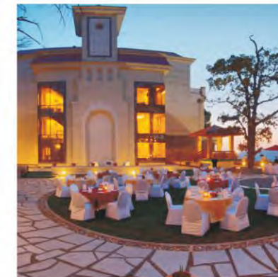
Royal Orchid Fort Resort, Mussoorie