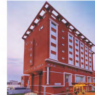
Hotel Royal Orchid, Jaipur