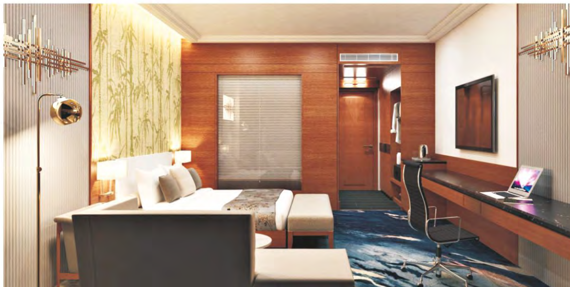
Interior Studio Room