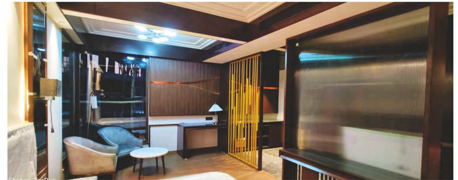
Actual Villa Interior Images @ Regenta Resort & Spa, Pushkar