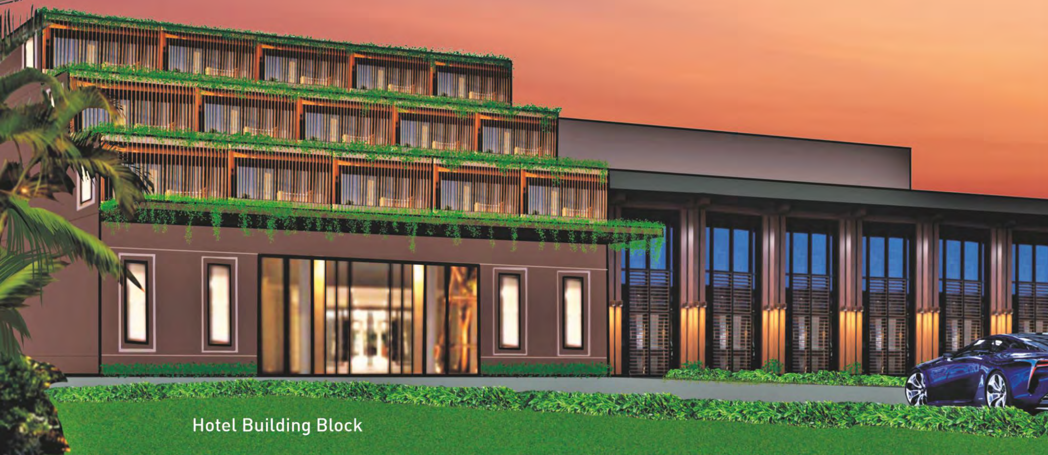
Hotel Building Block

All villas have picturesque lily pond at the entrance and the backyard. Inspired by the steady boats of the coast, the roofing compliments the tropical surroundings , regulating thermal comfort. Each and every villa has a different views facing The Aravali Hills and aquatic pool. Encompassed in the luscious greens get the perfect views without having to compromise your privacy. A serene flowing water to help you relax. One can indulge in our superluxurious Presidential Villas with private pool and loose themselves under the blanket of nature. Re-Sort yourself from the hassles of life in our tranquil eco-villas.