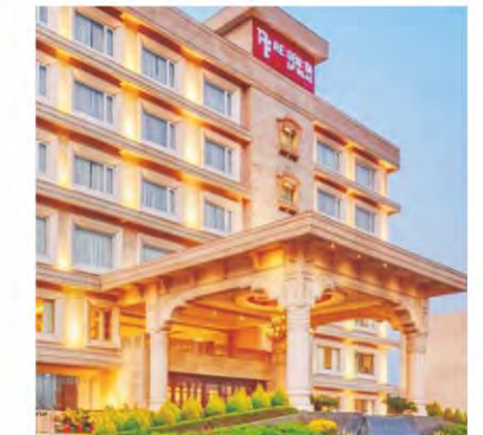
Regenta LP Vilas, Dehradun