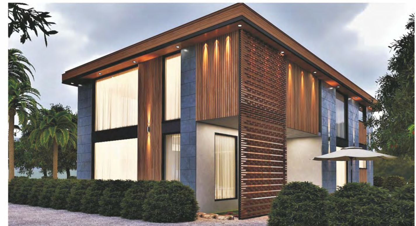
Presidential Villa With Private Pool