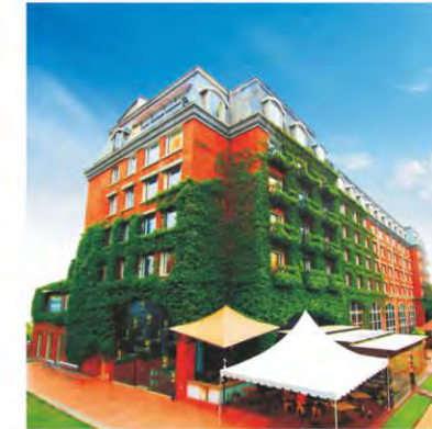
Hotel Royal Orchid, Bangalore