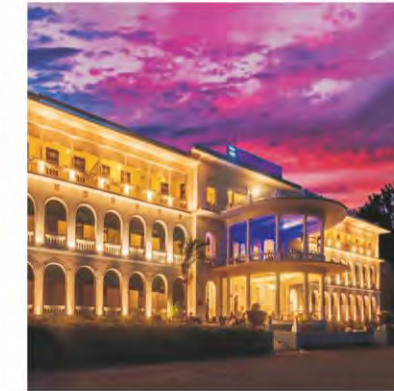
Royal Orchid Brindavan Garden Palace & Spa, Mysore