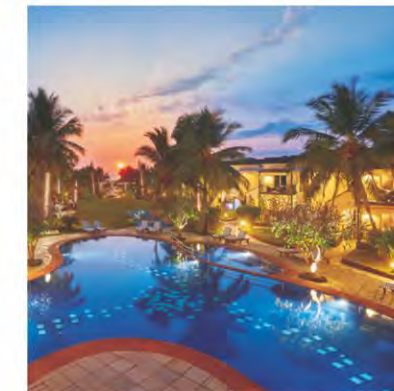
Royal Orchid Beach Resort & Spa, Goa