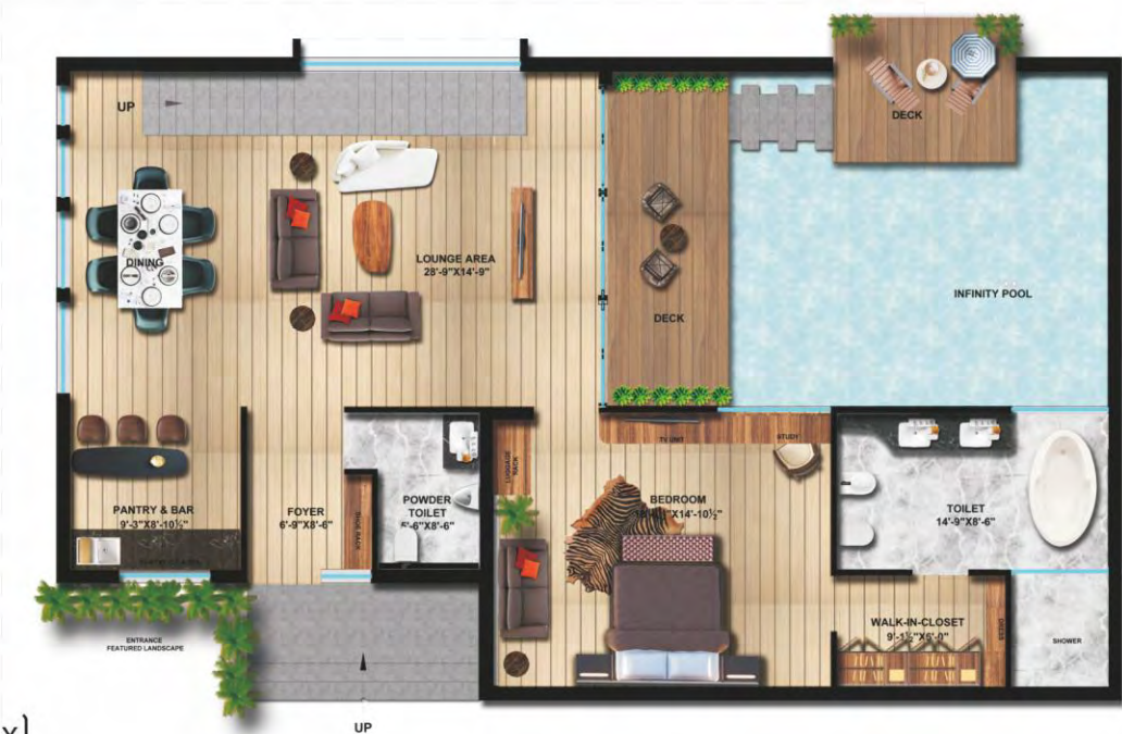
GROUND FLOOR PLAN AREA : 3800 SQ FT (Approx)